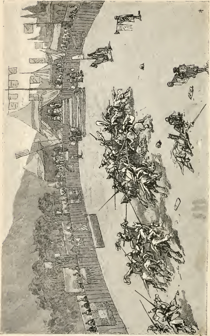
The Tournament at Camelot.